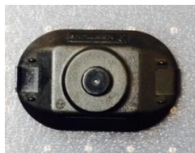
(Examples of water meter reading devices)